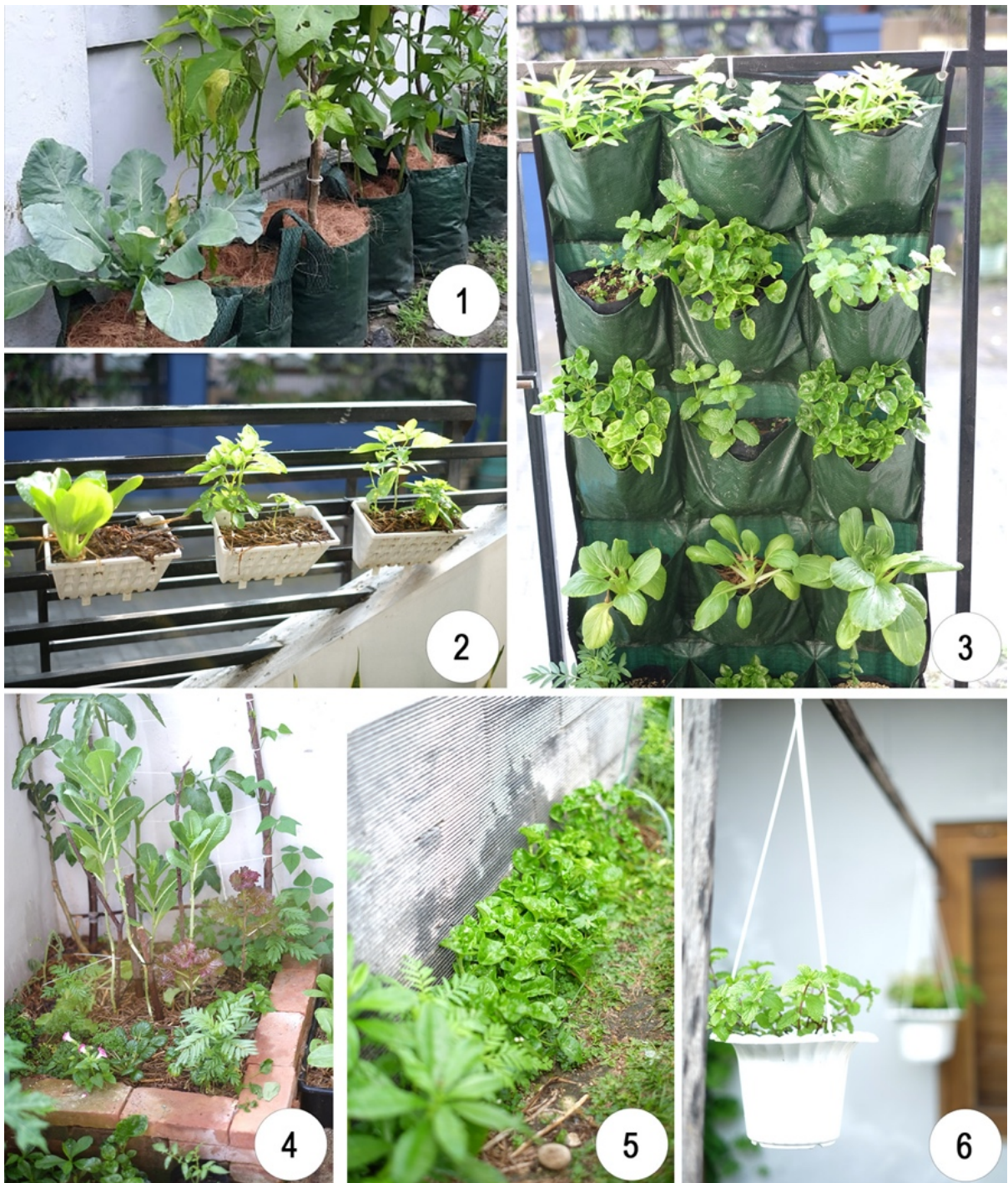
Figure 3: Cultivation techniques adopted for the kitchen garden; 1) containers, 2) over fence planters, 3) vertical planters on fence door, 4) raised bed, 5) directly in the ground, 6) hanging planters.