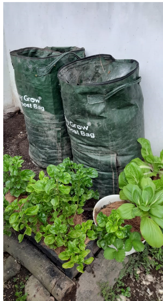
Figure 4: Composter bags for domestic composting.

luting it with water using a 1:10 ratio. For compost, daily organic scraps such as fruits' peels and vegetable scraps are suitable. To minimize space, a composter bag can be used for domestic composting (see Figure 4).