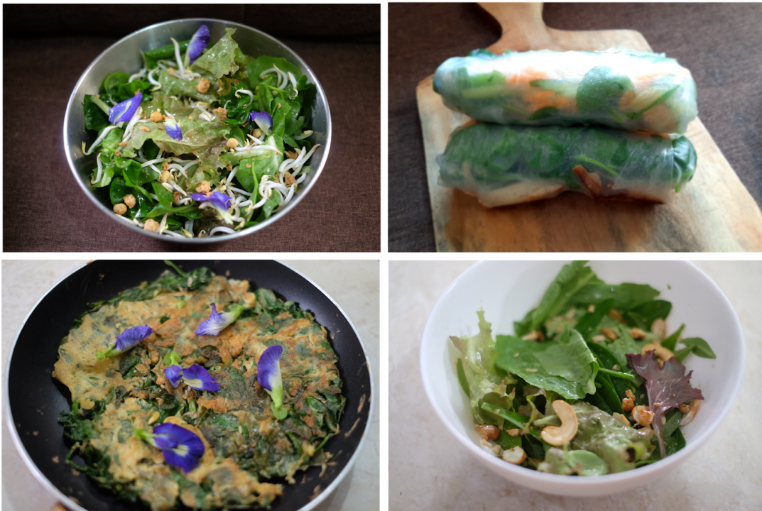
Figure 5: Homemade food with homegrown vegetables. Most vegetables, herbs, and garnishes come from our tiny food garden.