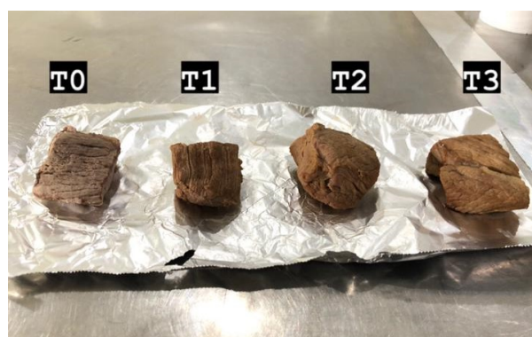
Figure 3: Beef appearance after the cooking process expressed as cooking loss. T0 is beef without cashew apple extract marination (CAM) and T1-3 are beef with CAM concentration of 10%, 20% and 30%, respectively.