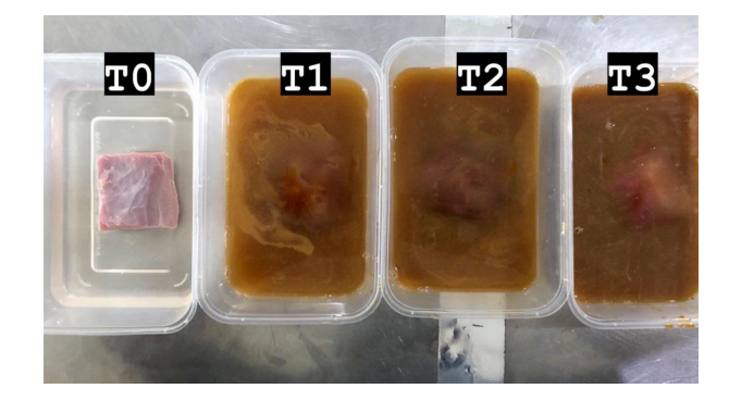
Figure 1: Cashew apple extract marinated (CAM) beef with the concentrations of 0% (T0), 10% (T1), 20% (T2) and 30% (T3) CAM.

water bath (Memmert, Germany) at a temperature of 60 ^{o} C for 60 min. Cooking loss was expressed as the percentage of difference between weights before and after cooking.